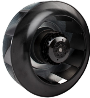
(251 dia. x 98 mm) 9.90 dia. x 3.86 inches